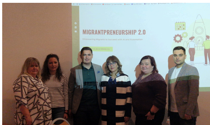
MEANS 2.0 Team